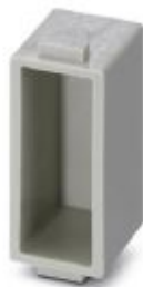
HEAVYCON dummy module, for unused slots in the module carrier frame

Please be informed that the data shown in this PDF Document is generated from our Online Catalog. Please find the complete data in the user's documentation. Our General Terms of Use for Downloads are valid ( http://phoenixcontact.com/download )