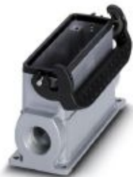
Box mounting base, with single locking latch, height 84 mm, without screw connection, 1x Pg29

Please be informed that the data shown in this PDF Document is generated from our Online Catalog. Please find the complete data in the user's documentation. Our General Terms of Use for Downloads are valid ( http://phoenixcontact.com/download )