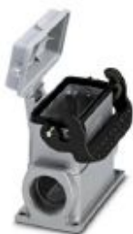
Box mounting base, with single locking latch, height 84 mm, without screw connection, 2x Pg29, with protective covers

Please be informed that the data shown in this PDF Document is generated from our Online Catalog. Please find the complete data in the user's documentation. Our General Terms of Use for Downloads are valid ( http://phoenixcontact.com/download )