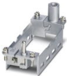
HEAVYCON hinged retaining frame, for HC-B 16 sleeve housing, for 4 modules, labeling with upper case letters (A, B, C, etc.)

Please be informed that the data shown in this PDF Document is generated from our Online Catalog. Please find the complete data in the user's documentation. Our General Terms of Use for Downloads are valid ( http://phoenixcontact.com/download )