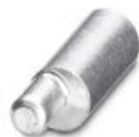
Cable lug for HEAVYCON-MODULAR; PE connection extension to 16 mm 2 , for crimping with crimp pliers