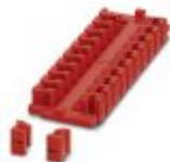
Fixing wedge to fix the hinged retaining frame (20 wedges on the block)