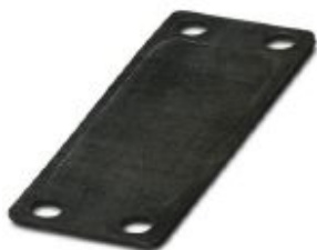
Replacement flange seal, for HEAVYCON panel mounting base type D15, self-adhesive, color: Black

Please be informed that the data shown in this PDF Document is generated from our Online Catalog. Please find the complete data in the user's documentation. Our General Terms of Use for Downloads are valid ( http://phoenixcontact.com/download )