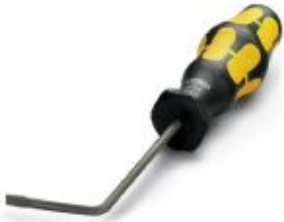
QUICKON lever tool, with angled head for confined spaces

Please be informed that the data shown in this PDF Document is generated from our Online Catalog. Please find the complete data in the user's documentation. Our General Terms of Use for Downloads are valid ( http://phoenixcontact.com/download )