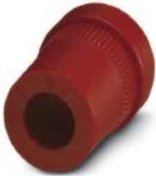
Rubber seal for Pg13.5 screw connection, for 9.0 mm ... 13.0 mm cable diameter

Please be informed that the data shown in this PDF Document is generated from our Online Catalog. Please find the complete data in the user's documentation. Our General Terms of Use for Downloads are valid ( http://phoenixcontact.com/download )