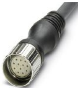
M23 socket, straight, 12-pos., with 10 m master cable, pin 9 and 10 bridged

Please be informed that the data shown in this PDF Document is generated from our Online Catalog. Please find the complete data in the user's documentation. Our General Terms of Use for Downloads are valid ( http://phoenixcontact.com/download )