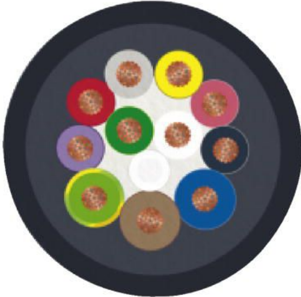
Cable cross section