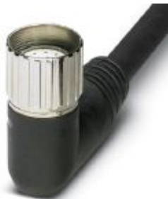
M23 socket, angled, 12-pos., with 5 m master cable, pin 9 and 10 bridged

Please be informed that the data shown in this PDF Document is generated from our Online Catalog. Please find the complete data in the user's documentation. Our General Terms of Use for Downloads are valid ( http://phoenixcontact.com/download )