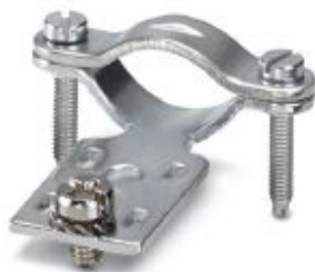
Strain relief clamps contact inserts of series: B-, BB-, D 40, D 64, DD and HV, straight cable exit

Please be informed that the data shown in this PDF Document is generated from our Online Catalog. Please find the complete data in the user's documentation. Our General Terms of Use for Downloads are valid ( http://phoenixcontact.com/download )