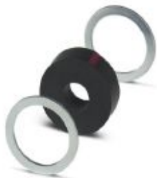
Notched seals/2 washers, for pressure screws, type Pg16

Please be informed that the data shown in this PDF Document is generated from our Online Catalog. Please find the complete data in the user's documentation. Our General Terms of Use for Downloads are valid ( http://phoenixcontact.com/download )