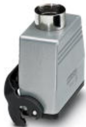
HEAVYCON coupling housing B16, with single locking latch, height 80 mm, with support 1x Pg29

Please be informed that the data shown in this PDF Document is generated from our Online Catalog. Please find the complete data in the user's documentation. Our General Terms of Use for Downloads are valid ( http://phoenixcontact.com/download )