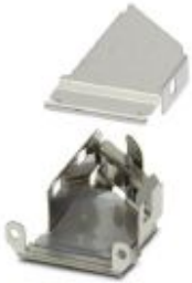
D-SUB EMC inner sleeve, shell size 2, shielded, for sleeve housing VS-15-...

Please be informed that the data shown in this PDF Document is generated from our Online Catalog. Please find the complete data in the user's documentation. Our General Terms of Use for Downloads are valid ( http://phoenixcontact.com/download )