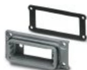
D-SUB panel mounting frame, shell size 2, IP67 degree of protection

D-SUB panel mounting frames - VS-15-A - 1688036