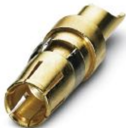
Power contacts, for D-SUB combination inserts, socket, solder cup, straight, rated current 20 A, gold-plated

Please be informed that the data shown in this PDF Document is generated from our Online Catalog. Please find the complete data in the user's documentation. Our General Terms of Use for Downloads are valid ( http://phoenixcontact.com/download )