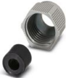
D-SUB cap nut with line seal, for sleeve housing VS-09-..., conductor diameter of 3 mm ... 6 mm

Please be informed that the data shown in this PDF Document is generated from our Online Catalog. Please find the complete data in the user's documentation. Our General Terms of Use for Downloads are valid ( http://phoenixcontact.com/download )