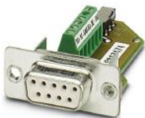
D-SUB CAN-BUS contact insert, type 09, version: Socket

Please be informed that the data shown in this PDF Document is generated from our Online Catalog. Please find the complete data in the user's documentation. Our General Terms of Use for Downloads are valid ( http://phoenixcontact.com/download )