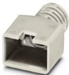
RJ45 bend protection sleeve, for pin insert VS-08-ST-RJ45, cable cross section up to 6 mm, color: gray

Please be informed that the data shown in this PDF Document is generated from our Online Catalog. Please find the complete data in the user's documentation. Our General Terms of Use for Downloads are valid ( http://phoenixcontact.com/download )