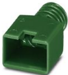
RJ45 bend protection sleeve, for pin insert VS-08-ST-RJ45, cable cross section up to 6 mm, color: green

Please be informed that the data shown in this PDF Document is generated from our Online Catalog. Please find the complete data in the user's documentation. Our General Terms of Use for Downloads are valid ( http://phoenixcontact.com/download )