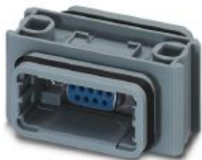
D-SUB coupling, shell size 1, socket, gender changer, shielded, connection direction straight, IP67 degree of protection

Please be informed that the data shown in this PDF Document is generated from our Online Catalog. Please find the complete data in the user's documentation. Our General Terms of Use for Downloads are valid ( http://phoenixcontact.com/download )