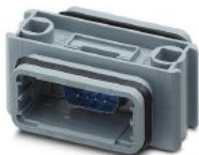
D-SUB coupling, shell size 1, pin, gender changer, shielded, connection direction straight, IP67 degree of protection

Please be informed that the data shown in this PDF Document is generated from our Online Catalog. Please find the complete data in the user's documentation. Our General Terms of Use for Downloads are valid ( http://phoenixcontact.com/download )