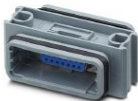
D-SUB coupling, shell size 2, socket, gender changer, shielded, connection direction straight, IP67 degree of protection

Please be informed that the data shown in this PDF Document is generated from our Online Catalog. Please find the complete data in the user's documentation. Our General Terms of Use for Downloads are valid ( http://phoenixcontact.com/download )