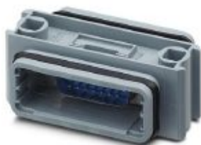
D-SUB coupling, shell size 2, pin, gender changer, shielded, connection direction straight, IP67 degree of protection

Please be informed that the data shown in this PDF Document is generated from our Online Catalog. Please find the complete data in the user's documentation. Our General Terms of Use for Downloads are valid ( http://phoenixcontact.com/download )