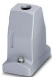
HEAVYCON ADVANCE EMV sleeve housing B10, with screw locking, height 100 mm, with 1xM32 thread, straight cable outlet

Please be informed that the data shown in this PDF Document is generated from our Online Catalog. Please find the complete data in the user's documentation. Our General Terms of Use for Downloads are valid ( http://phoenixcontact.com/download )