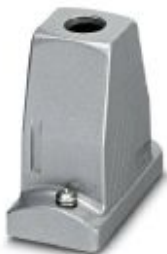
HEAVYCON ADVANCE standard powder-coated sleeve housing B10, with screw locking, height 100 mm, with 1x M32 thread, straight cable outlet

Please be informed that the data shown in this PDF Document is generated from our Online Catalog. Please find the complete data in the user's documentation. Our General Terms of Use for Downloads are valid ( http://phoenixcontact.com/download )