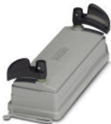
HEAVYCON ADVANCE IP65 protective cover B24, with bayonet locking, with retaining cord, diameter of retaining cord eyelet 3 mm

Please be informed that the data shown in this PDF Document is generated from our Online Catalog. Please find the complete data in the user's documentation. Our General Terms of Use for Downloads are valid ( http://phoenixcontact.com/download )