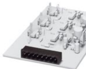
PCB headers, nominal current: 12 A, number of positions: 7, pitch: 5.08 mm, color: Agate gray, contact surface: Gold

Please be informed that the data shown in this PDF Document is generated from our Online Catalog. Please find the complete data in the user's documentation. Our General Terms of Use for Downloads are valid ( http://phoenixcontact.com/download )