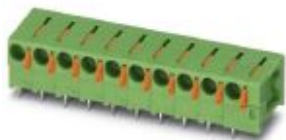
The figure shows the 10-position version

PCB terminal block, nominal current: 15 A, rated voltage (III/2): 400 V, nominal cross section: 1.5 mm 2 , pitch: 5.08 mm, number of positions: 4, connection method: Push-in spring connection, mounting: Wave soldering, conductor/PCB connection direction: 0 °, color: green, Pin layout: Linear double pinning, Solder pin [P]: 3.4 mm