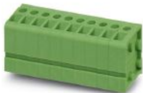
The figure shows the 10-position version

Please be informed that the data shown in this PDF Document is generated from our Online Catalog. Please find the complete data in the user's documentation. Our General Terms of Use for Downloads are valid ( http://phoenixcontact.com/download )