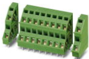
The figure shows a 10-position version

PCB terminal block, nominal current: 16 A, nom. voltage: 400 V, pitch: 5 mm, number of positions: 2, connection method: Spring-cage connection, mounting: Wave soldering, conductor/PCB connection direction: 45°, color: green