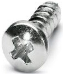
Screw set for DFK-PC 16... connectors

Please be informed that the data shown in this PDF Document is generated from our Online Catalog. Please find the complete data in the user's documentation. Our General Terms of Use for Downloads are valid ( http://phoenixcontact.com/download )