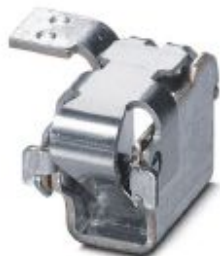
Photovoltaic connector, Single contact, type: Circular conductor connection, single-pos., Connection method: Push-in spring connection

Please be informed that the data shown in this PDF Document is generated from our Online Catalog. Please find the complete data in the user's documentation. Our General Terms of Use for Downloads are valid ( http://phoenixcontact.com/download )