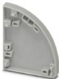
Spacer plate, for electrical isolation between the individual feed-through terminal blocks, width: 6 mm, color: gray

Please be informed that the data shown in this PDF Document is generated from our Online Catalog. Please find the complete data in the user's documentation. Our General Terms of Use for Downloads are valid ( http://phoenixcontact.com/download )