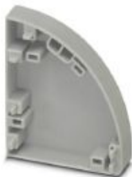
Spacer plate, for electrical isolation between the individual feed-through terminal blocks, width: 9 mm, color: gray

Please be informed that the data shown in this PDF Document is generated from our Online Catalog. Please find the complete data in the user's documentation. Our General Terms of Use for Downloads are valid ( http://phoenixcontact.com/download )