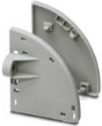
Mounting flange, for mounting directly on the wall

Please be informed that the data shown in this PDF Document is generated from our Online Catalog. Please find the complete data in the user's documentation. Our General Terms of Use for Downloads are valid ( http://phoenixcontact.com/download )