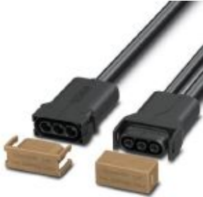
SUNCLIX micon AC Y-distributor, 3-pos., IP67, 20 A/5 A, 600 V, trunk cable: 1.15 m, drop cable: 0.5 m, incl. dust protection caps, North American version

Please be informed that the data shown in this PDF Document is generated from our Online Catalog. Please find the complete data in the user's documentation. Our General Terms of Use for Downloads are valid ( http://phoenixcontact.com/download )