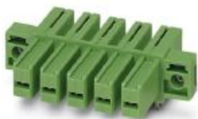
The figure shows a 5-pos. version of the product

PCB headers, nominal current: 41 A, rated voltage (III/2): 630 V, nominal cross section: 6 mm 2 , number of positions: 2, pitch: 7.62 mm, color: green, contact surface: Tin, mounting: Wave soldering, pin layout: Linear pinning, solder pin [P]: 5 mm