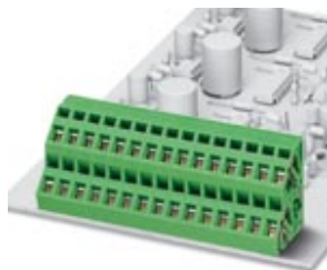
PCB terminal block, nom. voltage: 400 V, pitch: 5 mm, number of positions: 6, color: gray

Please be informed that the data shown in this PDF Document is generated from our Online Catalog. Please find the complete data in the user's documentation. Our General Terms of Use for Downloads are valid ( http://phoenixcontact.com/download )