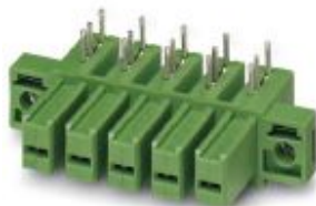
The figure shows a 5-pos. version of the product

PCB headers, nominal current: 41 A, rated voltage (III/2): 630 V, nominal cross section: 6 mm 2 , number of positions: 12, pitch: 7.62 mm, color: green, contact surface: Tin, mounting: Wave soldering, pin layout: Linear pinning, solder pin [P]: 5 mm