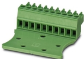
The figure shows the 10-position version

Please be informed that the data shown in this PDF Document is generated from our Online Catalog. Please find the complete data in the user's documentation. Our General Terms of Use for Downloads are valid ( http://phoenixcontact.com/download )