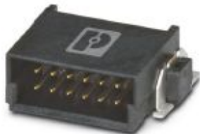
The figure shows a 12-pos. version with 12 contacts

SMD male connector, Nominal current at 20 °C: 1.4 A, Test voltage: 500 V AC, number of positions: 16, pitch: 1.27 mm, color: black, contact surface: Gold, mounting: SMD soldering