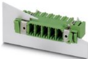
The figure shows a 5-pos. version of the product

Feed-through header, nominal current: 41 A, rated voltage (III/2): 630 V, nominal cross section: 6 mm 2 , number of positions: 8, pitch: 7.62 mm, color: green, contact surface: Tin, mounting: Wave soldering, pin layout: Linear pinning, solder pin [P]: 5 mm