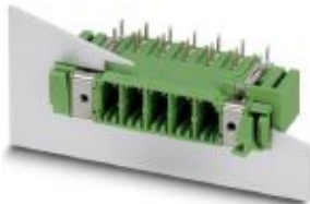
The figure shows a 5-pos. version of the product

Feed-through header, nominal current: 41 A, rated voltage (III/2): 630 V, nominal cross section: 6 mm 2 , number of positions: 10, pitch: 7.62 mm, color: green, contact surface: Tin, mounting: Wave soldering, pin layout: Linear pinning, solder pin [P]: 4.26 mm