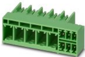
Figure shows a 5+6-pos. version

PCB hybrid header, nominal current: 41 A, rated voltage (III/2): 630 V, nominal cross section: 6 mm 2 , number of positions: 11, pitch: 7.62 mm, color: black, contact surface: Silver, mounting: Wave soldering, pin layout: Linear pinning, solder pin [P]: 2.6 mm