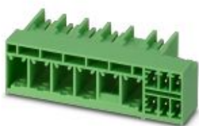
Figure shows a 5+6-pos. version with locking flange at position 5

PCB hybrid header, nominal current: 41 A, rated voltage (III/2): 630 V, nominal cross section: 6 mm 2 , number of positions: 11, pitch: 7.62 mm, color: green, contact surface: Tin, mounting: Wave soldering, pin layout: Linear pinning, solder pin [P]: 2.6 mm