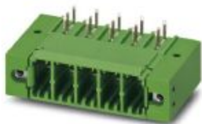
The figure shows a 5-pos. version of the product

PCB headers, nominal current: 41 A, rated voltage (III/2): 630 V, nominal cross section: 6 mm 2 , number of positions: 11, pitch: 7.62 mm, color: green, contact surface: Tin, mounting: Wave soldering, pin layout: Linear pinning, solder pin [P]: 4.2 mm