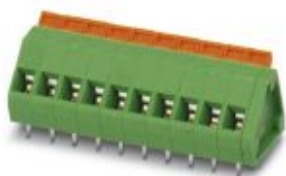
The figure shows the 10-position version

PCB terminal block, nominal current: 16 A, rated voltage (III/2): 400 V, nominal cross section: 1.5 mm 2 , pitch: 5.08 mm, number of positions: 16, connection method: Spring-cage connection, mounting: Wave soldering, conductor/PCB connection direction: 45 °, color: green, Pin layout: Linear double pinning, Solder pin [P]: 3.5 mm