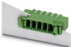
The figure shows a 5-pos. version of the product

Feed-through header, nominal current: 41 A, rated voltage (III/2): 630 V, nominal cross section: 6 mm 2 , number of positions: 9, pitch: 7.62 mm, color: green, contact surface: Tin, mounting: Wave soldering, pin layout: Linear pinning, solder pin [P]: 4.9 mm