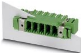
The figure shows a 5-pos. version of the product

Feed-through header, nominal current: 41 A, rated voltage (III/2): 630 V, nominal cross section: 6 mm 2 , number of positions: 12, pitch: 7.62 mm, color: green, contact surface: Tin, mounting: Wave soldering, pin layout: Linear pinning, solder pin [P]: 4.9 mm